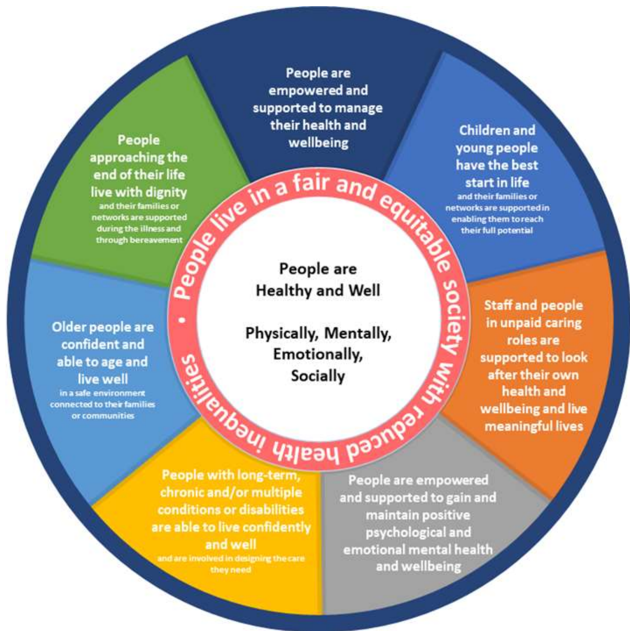
Figure 3 – Overview of the Strategic Outcomes Framework

6.8. The concept behind the SOF is as follows: